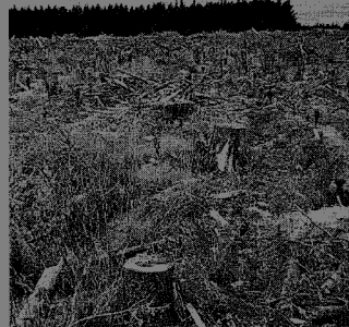
Reducing environmental impacts of site preparation.

better penetration and are able to spread, which also adds to the stability and significant advances in growth.